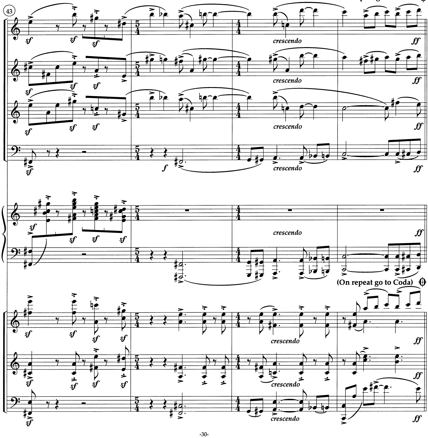
(On repeat go to Coda)